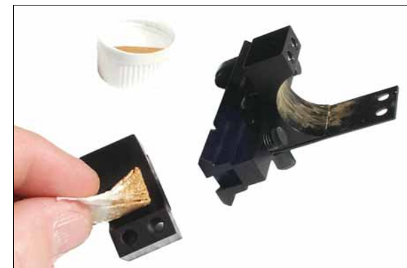
Step 4 - Using the resin pack enclosed, lightly dust the interior curved surfaces of both the primary and secondary mounting blocks.