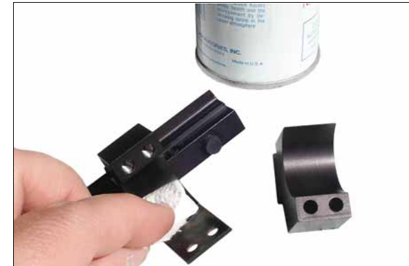
Step 3 - De-grease the interior curved surfaces of both the primary and secondary mounting blocks. Also de-grease the area on the barrel where the I-Mount is to be installed.