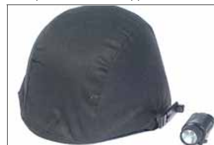
Helmet Mount For Hands-Free Search