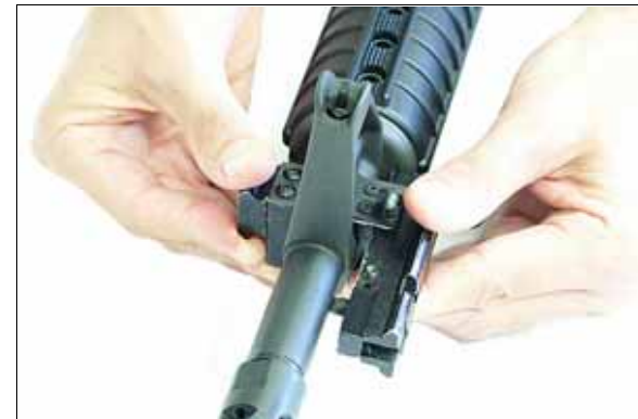
Step 9 - Adjust the mount to the desired angle, with the mount as close to the forearm as possible.