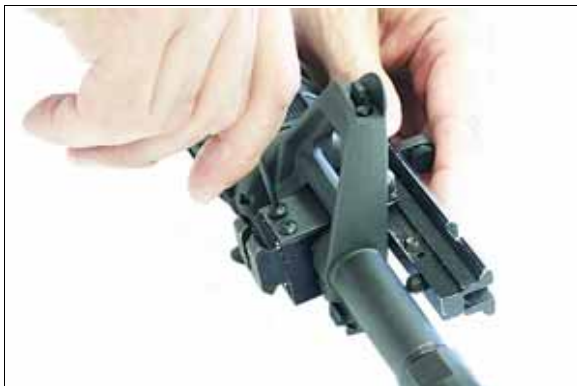
Step 7 - Using the small wrench, use the two short cap screws to secure the secondary block to the top plate. Do Not Use Lock-tite Yet!