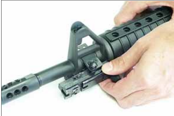
Step 5 - Mount the primary (rail) top plate between the barrel and gas tube, with the block against the barrel.