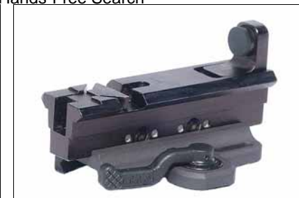
Detachable ARMS 17 Mount.

The Lightlink I-Mount permits you to mount Streamlight (M3 & M6), Glock, LEDWave (Z5) and Surefire X200 tactical lights, Springfield Armory tactical lights (requires a rear spacer block), or Surefire Millenium lights (with a different lockin bar). The Lightlink I-Mount will also permit you to mount a second accessory, and comes with a quick detach (patrol style) mounted sling swivel stud.