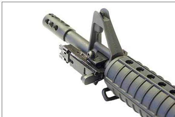
I-Mount on A2 Carbine

IMPORTANT: READ THESE MATERIALS BEFORE YOU USE THIS PRODUCT!