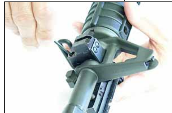
Step 10 - While holding the mount in place, tighten the shoulder screws. Do not over-tighten, but ensure that the mount is clamped in place and can not move.