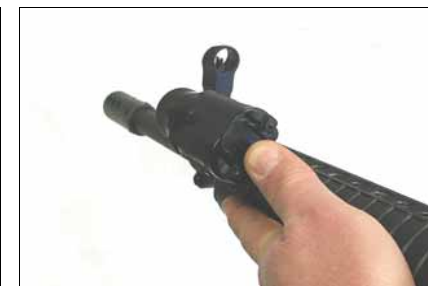
Upper Forearm Mount For A2 Forearm