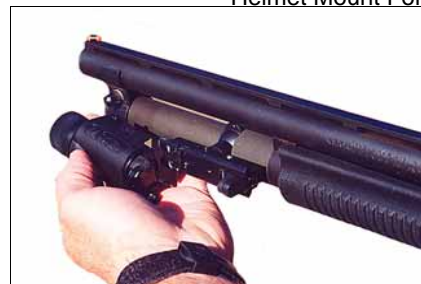
Shotgun I-Mount On Remington