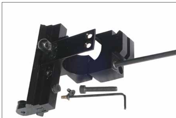
Step 1 - Disassemble the I-Mount by removing the screws from the secondary mounting block with the enclosed allen wrenches.

Note: The instructions depicted here apply to mounts for right-handed users, requiring mounting on the left side of the barrel. Mounts designed for left-handed users will be installed in an identical, or mirrored, manner on the opposite side of the barrel.