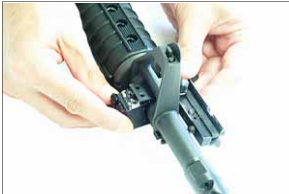
Step 6 - Place the secondary block on the opposite side of the barrel below the top plate.