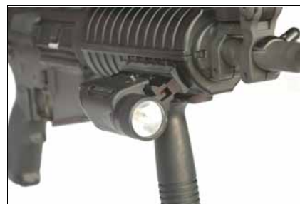
Low Vertical Fore-Grip Mount.